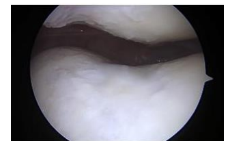
Arthroscopic 2 nd Look